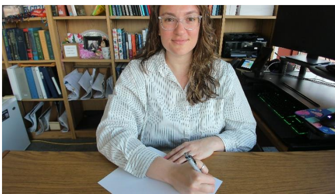
Option 1: Internal camera setup to show scratch paper up to head. If you cannot get this view with your internal camera, you MUST use an external camera (option 2).